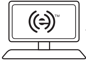
ENGAGE web and mobile APP